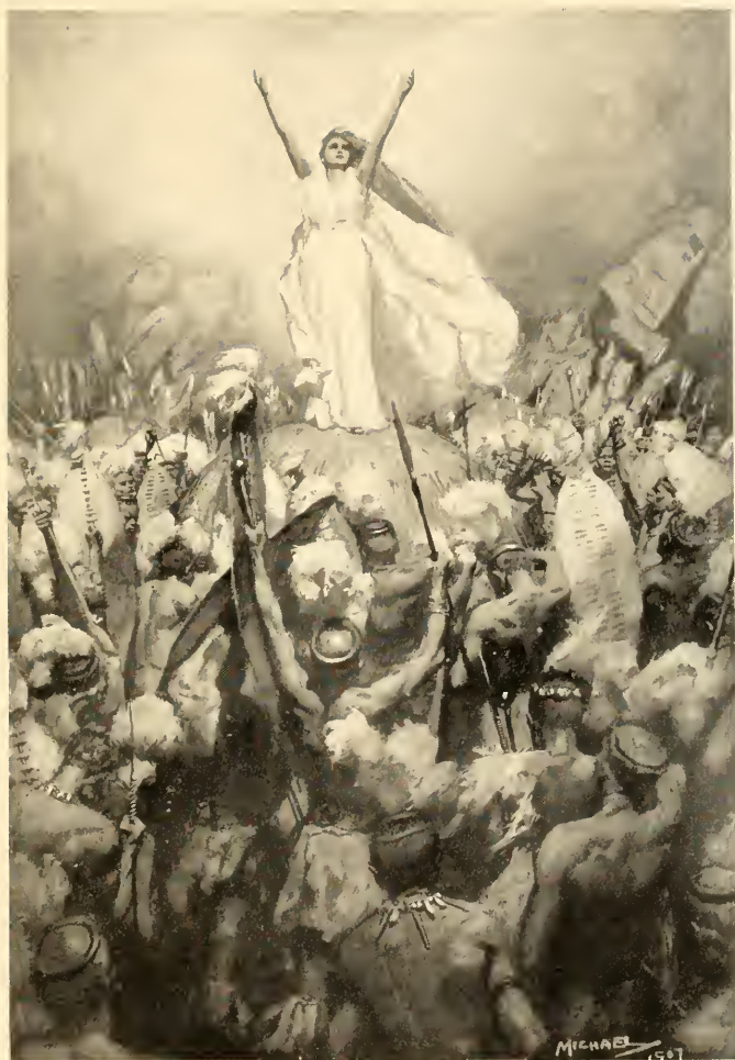
" She seemed no woman, but a queen of Spirits " (see page 245).